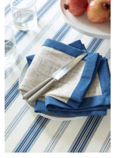
HEMSBY CHECK Cobalt, Oatmeal