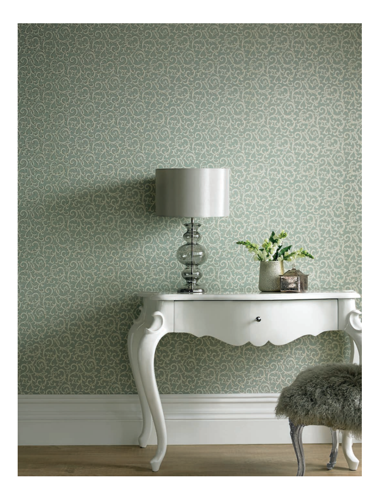
AVINGTON COLLECTION {\sf Brodsworth}