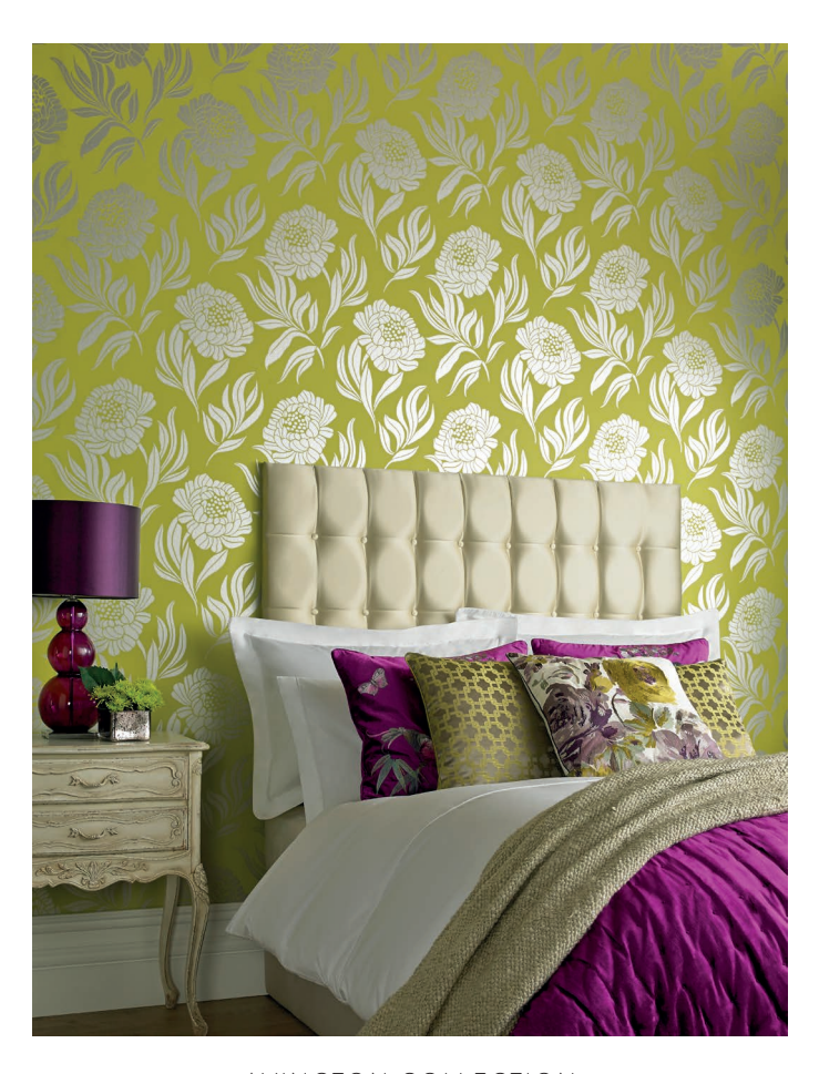
AVINGTON COLLECTION Chatsworth