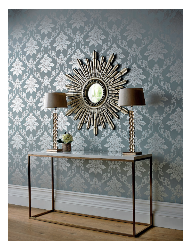
ROSEMORE COLLECTION Hampton