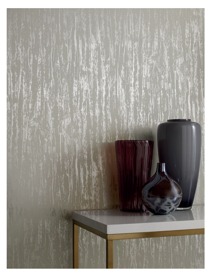
ROSEMORE COLLECTION Helmsley