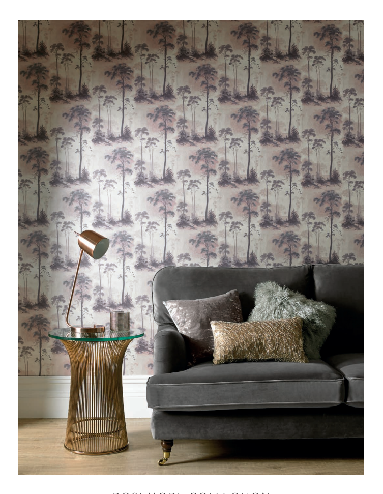
ROSEMORE COLLECTION Prior Park