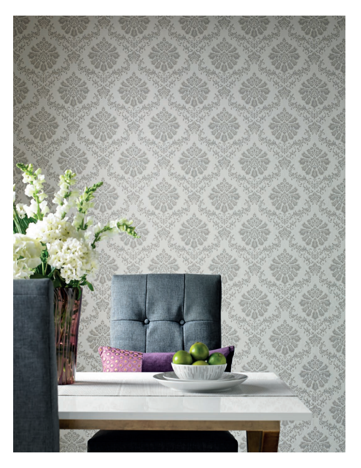
AVINGTON COLLECTION Broughton