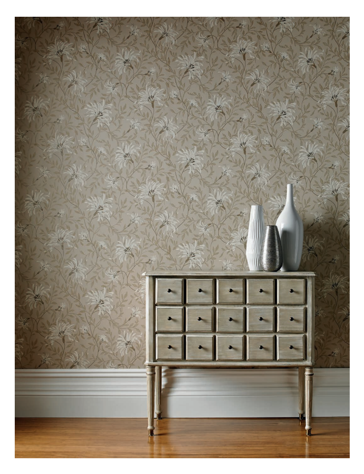
ROSEMORE COLLECTION Fairhaven