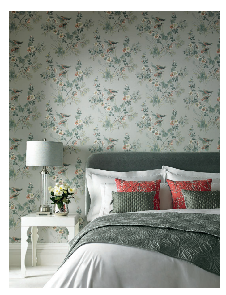
ROSEMORE COLLECTION Rosemore