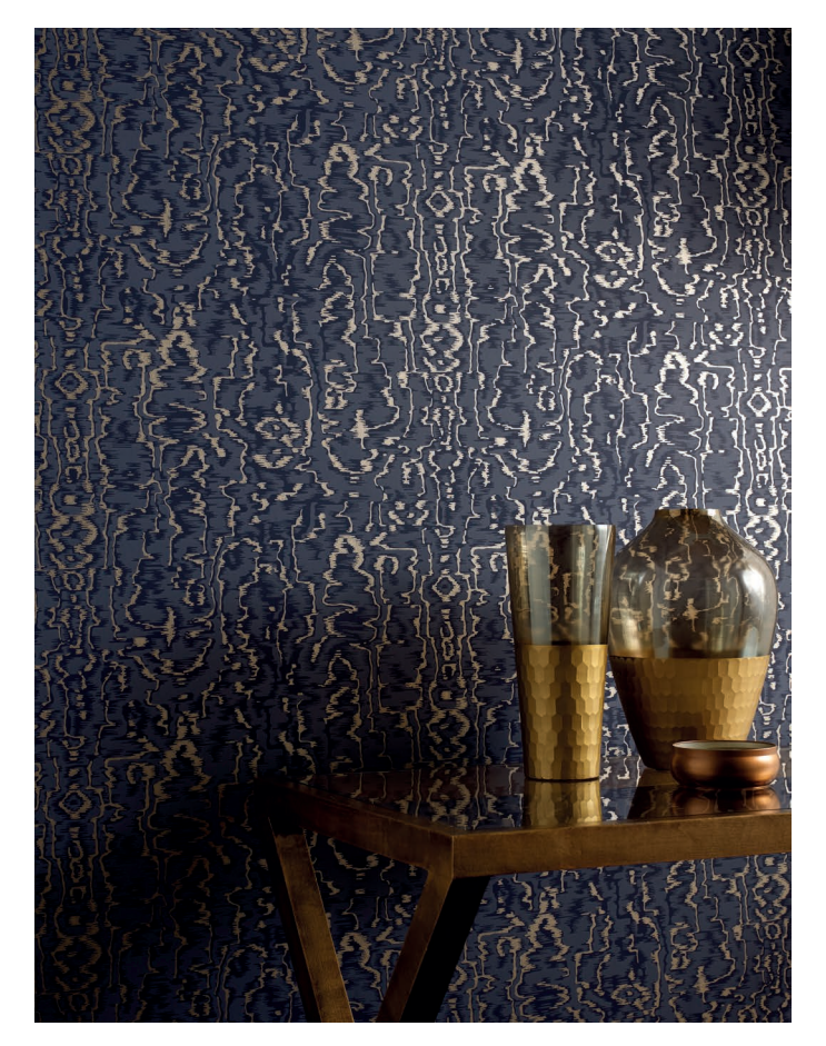
AVINGTON COLLECTION Avington